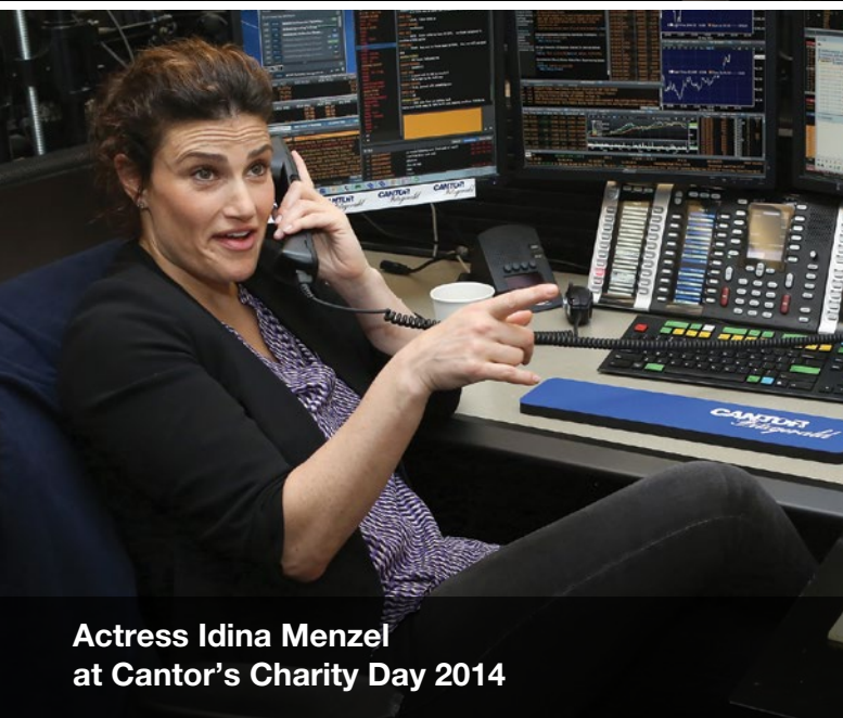
Actress Idina Menzel at Cantor's Charity Day 2014

If you are a non-profit charitable organization and wish to be considered to participate in Cantor Fitzgerald's Annual Charity Day on Friday, September 11, 2015 please complete this application.