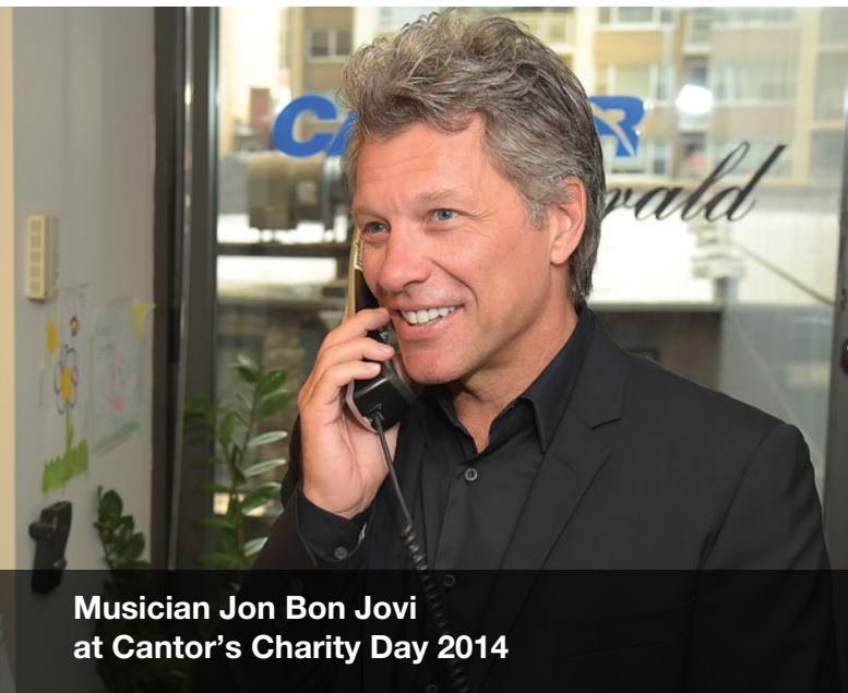
Musician Jon Bon Jovi at Cantor's Charity Day 2014