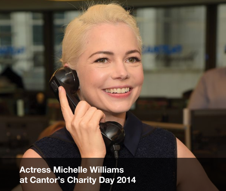
Actress Michelle Williams at Cantor's Charity Day 2014