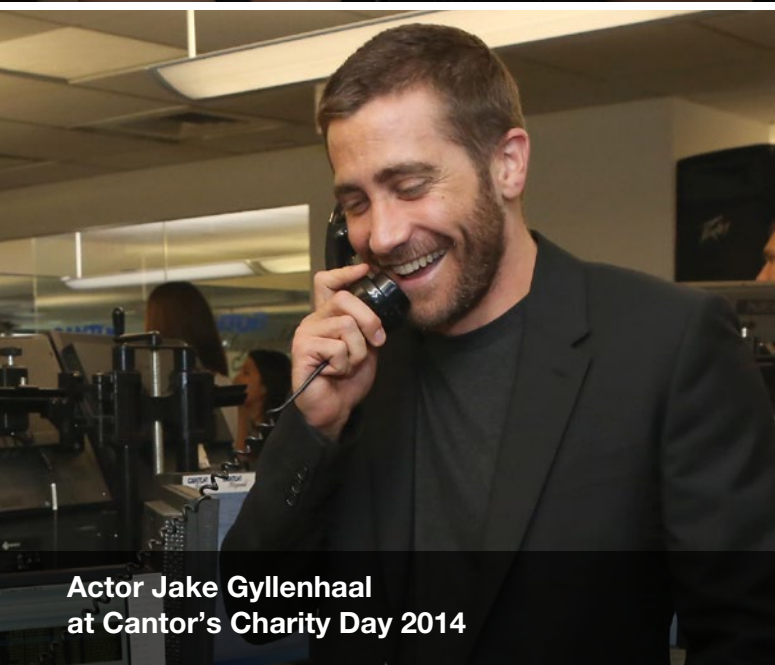
Actor Jake Gyllenhaal at Cantor's Charity Day 2014

The Cantor Fitzgerald Relief Fund, Cantor Fitzgerald and our affiliate BGC Partners commemorate our 658 friends and colleagues and 61 Eurobroker employees who perished in the September 11, 2001 World Trade Center attacks by donating 100% of our revenues on Charity Day to dozens of charities worldwide.